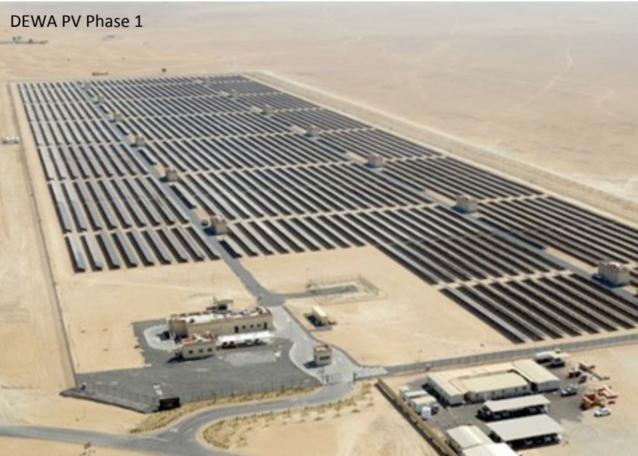
DEWA PV Phase 1